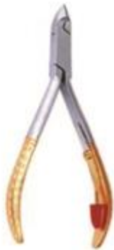
CNN-013 Cuticle nipper(6mm) Designed handles Size: 10 cm