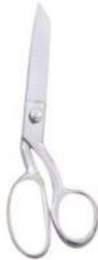
HHS-007 Taylor scissors Size: 9", 10", 11", 12"