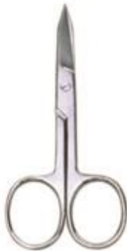
NCS-004 Professional hair cutting scissors (Str & Cvd) Fix screw 3.5"