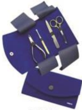
BK-001 beauty Kit with 4 pcs with high quality gift pack