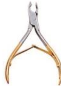
CNN-016 Cuticle nipper 4,6,8 mm Half gold Size: 10 cm