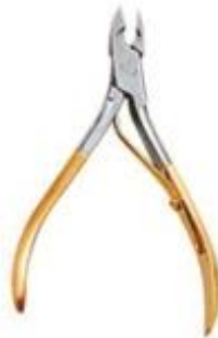
CNN-017 Cuticle nipper 4,6,8 mm Half gold Size: 10 cm