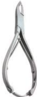
CNN-002 Cuticle nipper(6mm) Back lock heavy weight Size: 11 cm