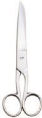
HHS-001 House hold scissors Size: 5", 6", 7", 8"