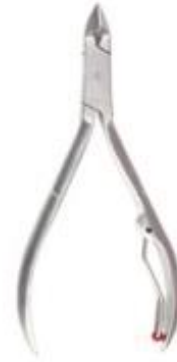
CNN-008 Cuticle nipper(6mm) Box joint wire spring Size: 10cm