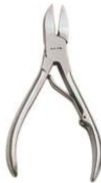
NC-008 Nail cutter plain handle Size: 10, 12 cm