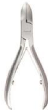
NC-009 Nail cutter textured handle Size: 10 cm