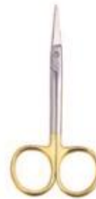
NCS-006 Professional hair cutting scissors (Str & Cvd) Fix screw 3.5"