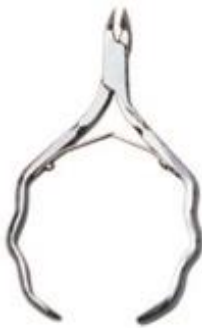
CNN-009 Cuticle nipper Box joint zig zag handle Size: 11 cm