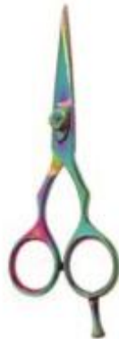
RBS-004 Professional hair cutting scissors infused multicolor two rings Size: 5.5", 6", 6.5",