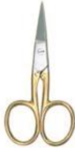
NCS-001 Nail scissors (Str & Cvd) Fix Screw Size 4"