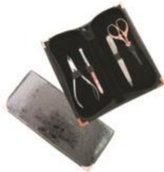
BK-003 beauty Kit with 4 pcs with high quality gift pack