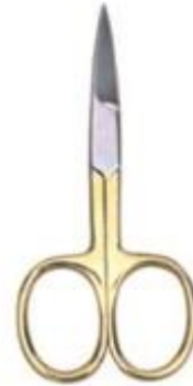
NCS-009 IRIS scissors (Str & Cvd) Fix Screw size: 4", 5.5"s