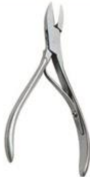
NC-001 Nail cutter single spring Size: 12 cm