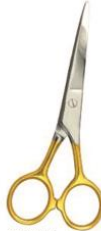
BBS-003 Professional hair cutting scissors Size: 5.5", 6", 6.5"