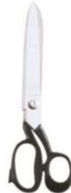
HHS-009 Taylor scissor in color ring Size: 9", 10", 11", 12"