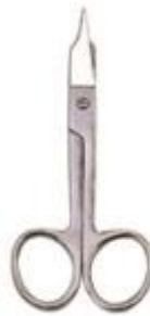
NCS-005 Professional hair cutting scissors (Str & Cvd) Fix screw 3.5"