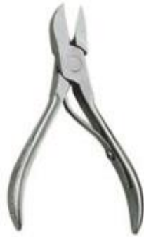
NC-004 Nail cutter single & double spring with plain handle Size: 12 cm