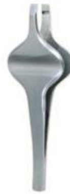
BET-020 Eyebrow tweezer Size: 12 cm