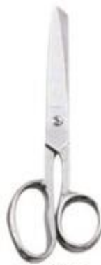
HHS-005 Tylor scissor Size: 6", 7", 8"