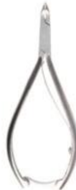
CNN-003 Cuticle nipper(6mm) Box joint single spring Size: 12 cm