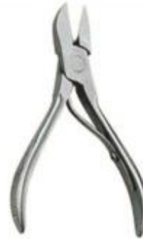
NC-003 Nail cutter double spring with texture handle Size: 10 cm