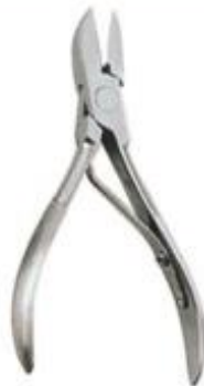
NC-002 Nail cutter single spring double finish Size: 11 cm