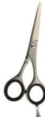
BBS-006 Professional hair cutting scissors Size: 5.5", 6", 6.5"