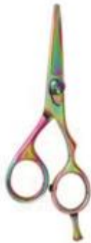
RBS-001 Professional hair cutting scissors infused multicolor two rings Size: 5.5", 6", 6.5",