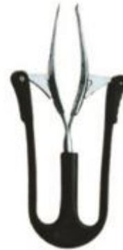
BET-022 Automatic Eyebrow tweezer with plastic handle Size: 4 "