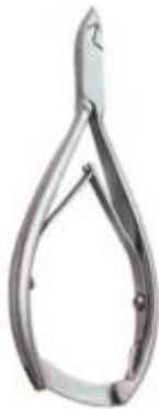
CNN-001 Cuticle nipper(6mm) Back lock heavy weight Size: 11.5 cm