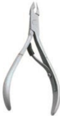
CNN-005 Cuticle nipper(6mm) (4 / 6 / 8 mm) Size: 10 cm