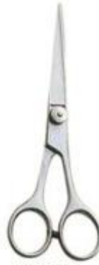
BBS-008 Professional hair cutting scissors Handle adjustable screw Size: 5.5", 6", 6.5"