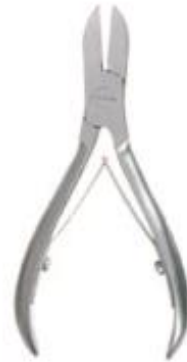
NC-006 Nail cutter double spring straight jaw lap joint Size: 12 cm