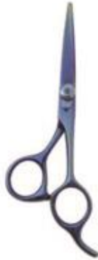
RBS-008 Professional hair cutting scissors infused multicolor two rings Size: 5.5", 6", 6.5",