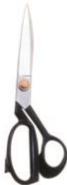
HHS-008 Taylor scissors sharp point Size: 9", 10", 11", 12"