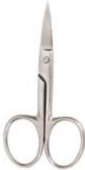
NCS-007 Nail arrow point scissors (Str & Cvd) Fix screw 3.5"