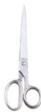
HHS-006 Taylor scissor sharp point Size: 7", 8"