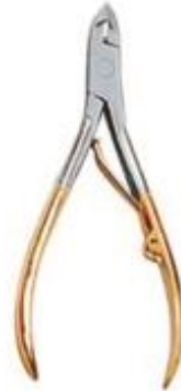
CNN-015 Cuticle nipper 4,6,8 mm Half gold Size: 10 cm