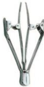
BET-023 Automatic Eyebrow tweezer Size: 4.25"