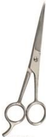
BBS-001 Professional hair cutting scissors Size: 5.5", 6", 6.5"