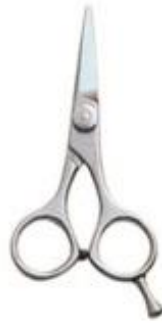
BBS-011 Professional hair cutting scissors Size: 5.5", 6", 6.5"