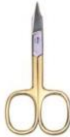
NCS-002 Nail arrow point scissors (Str & Cvd) Fix screw 3.5"