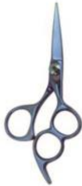
RBS-007 Professional hair cutting scissors infused multicolor three rings Size: 5.5", 6", 6.5",