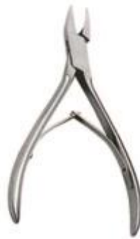
NC-005 Nail cutter arrow point Size: 4.5", 5"