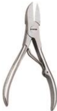
NC-007 Nail cutter textured handle Size: 10, 12 cm