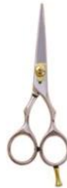
RBS-001 Professional hair cutting scissors infused two rings Size: 5.5", 6". 6.5",