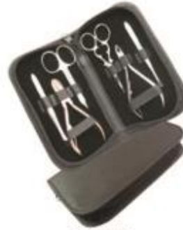
BK-002 beauty Kit with 6 pcs with high quality gift pack