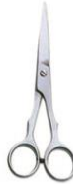
BBS-009 Professional hair cutting scissors Size: 5.5", 6", 6.5"