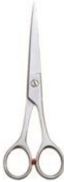
BBS-007 Professional hair cutting scissors Size: 5.5", 6", 6.5"