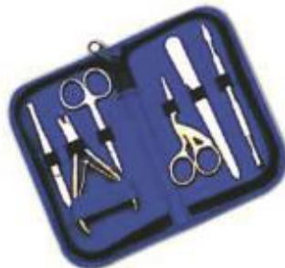
BK-005 beauty Kit with 6 pcs with high quality gift pack