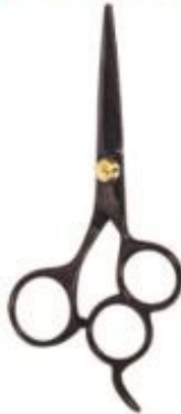
RBS-001 Professional hair cutting scissors infused colored three rings Size: 5.5", 6", 6.5",