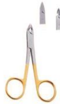
CNN-012 Cuticle nipper scissors with rings Size: 10 cm