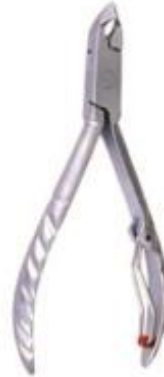
CNN-007 Cuticle nipper(6mm) Lap joint designed handles with wire Size: 10 cm