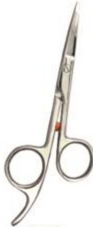
BBS-002 Professional hair cutting scissors Size: 5.5", 6", 6.5", 7"