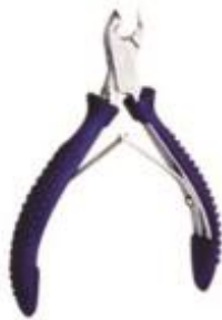
CNN-014 Cuticle nipper 4,6,8 mm double spring with silicon grip Size: 11.5 cm