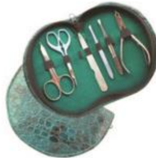
BK-004 beauty Kit with 6 pcs with high quality gift pack