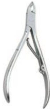
CNN-006 Cuticle nipper(6mm) (4 / 6 / 8 mm) Size: 10 cm