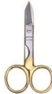
NCS-003 Nail arrow point scissors (Str & Cvd) Fix screw 3.5"