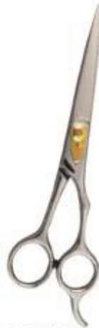
BBS-005 Professional hair cutting scissors Size: 5.5", 6", 6.5"