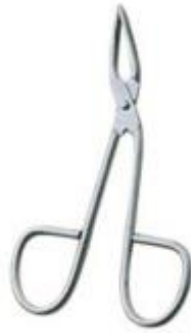
BET-018 Eyebrow forcep (Str & Slunt) Size: 3.5"