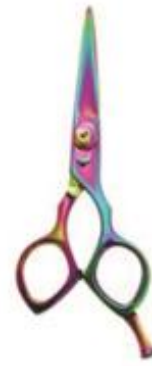
RBS-006 Professional hair cutting scissors infused multicolor two rings Size: 5.5", 6", 6.5",