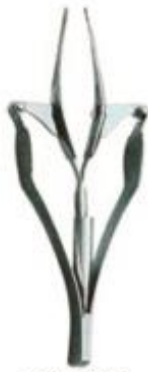
BET-022 Automatic Eyebrow tweezer Size: 4.25"