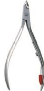
CNN-004 Cuticle nipper(6mm) Single spring lap joint Size: 10 cm