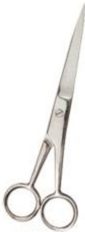
BBS-004 Professional hair cutting scissors Size: 5.5", 6", 6.5"