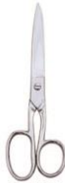
HHS-003 G.T Scissors Size: 6", 7", 8"