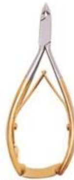
CNN-011 Cuticle nipper(6mm) Half gold with back lock Size: 11.5 cm