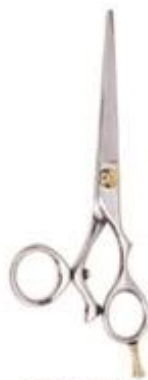
RBS-001 Professional hair cutting scissors infused moveable rings Size: 5.5", 6". 6.5",