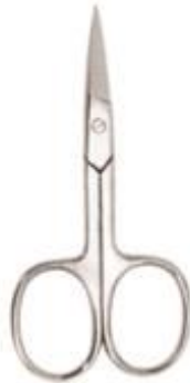
NCS-008 Nail arrow point scissors (Str & Cvd) Fix screw 3.5"